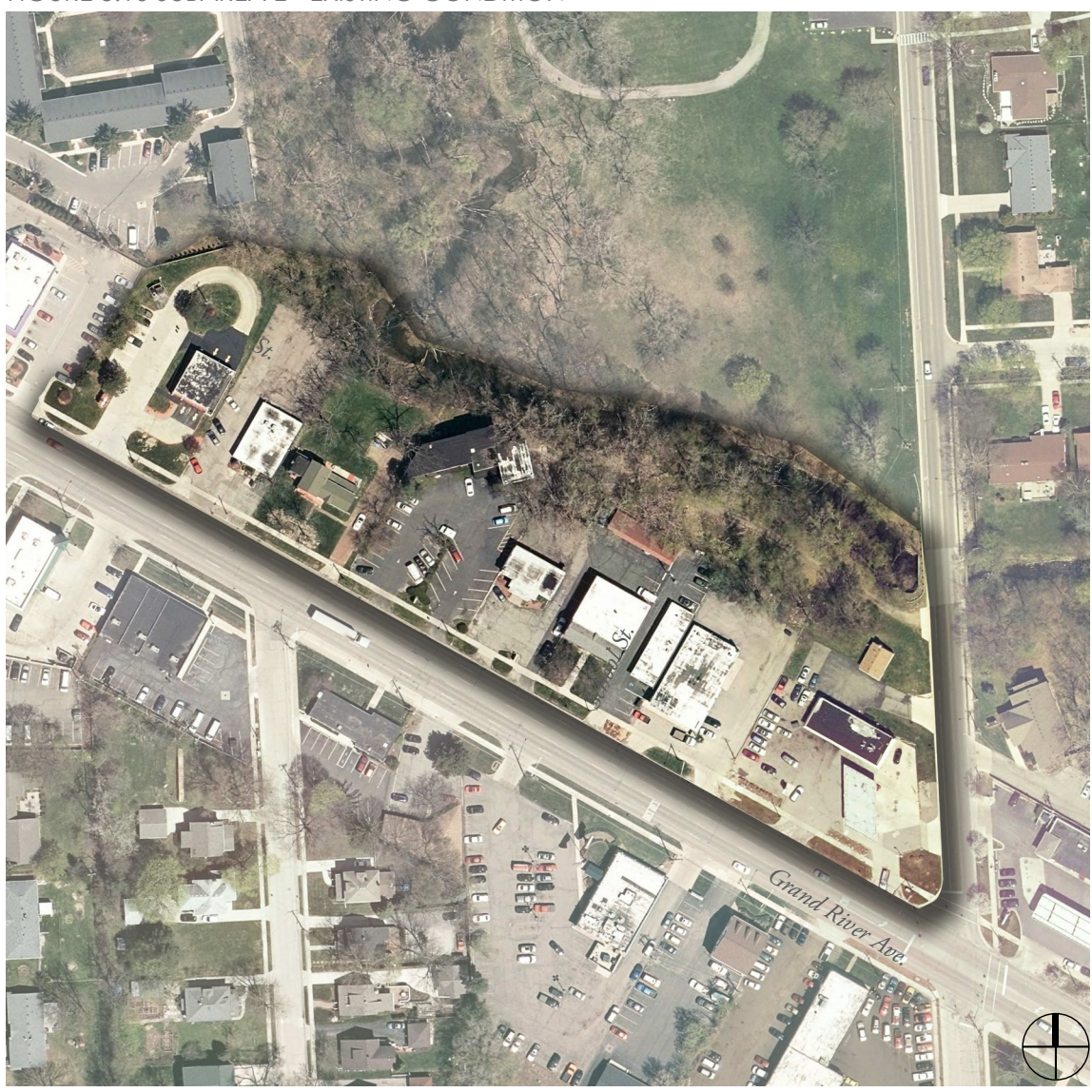
FIGURE 3.16 SUBAREA E - EXISTING CONDITION