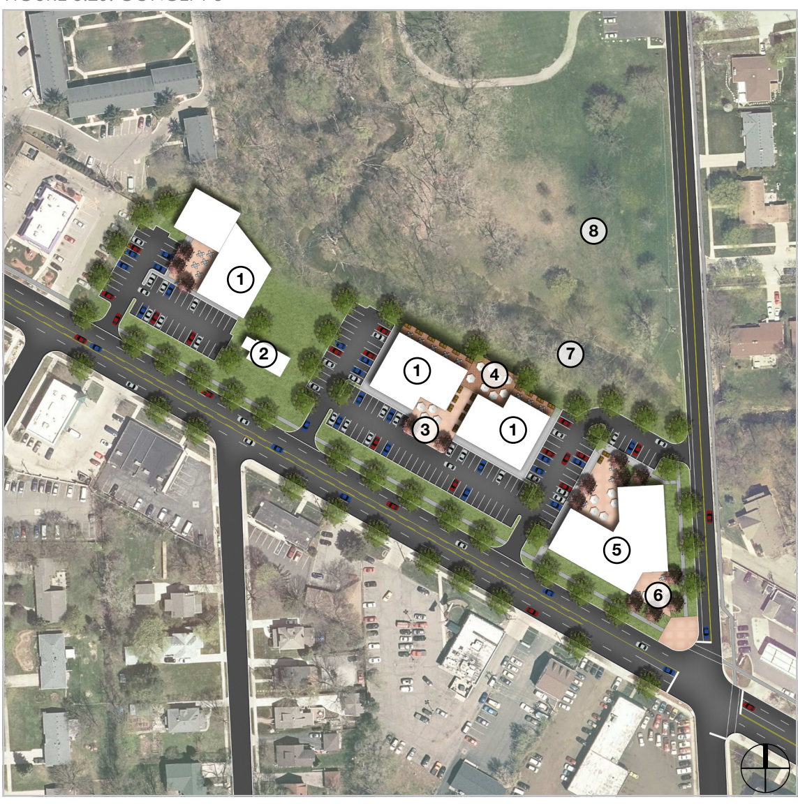
FIGURE 3.20: CONCEPT 3