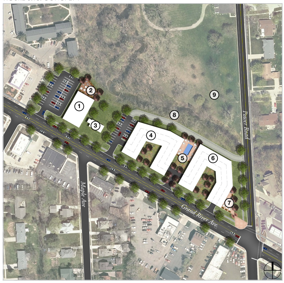
FIGURE 3.18: CONCPET 1