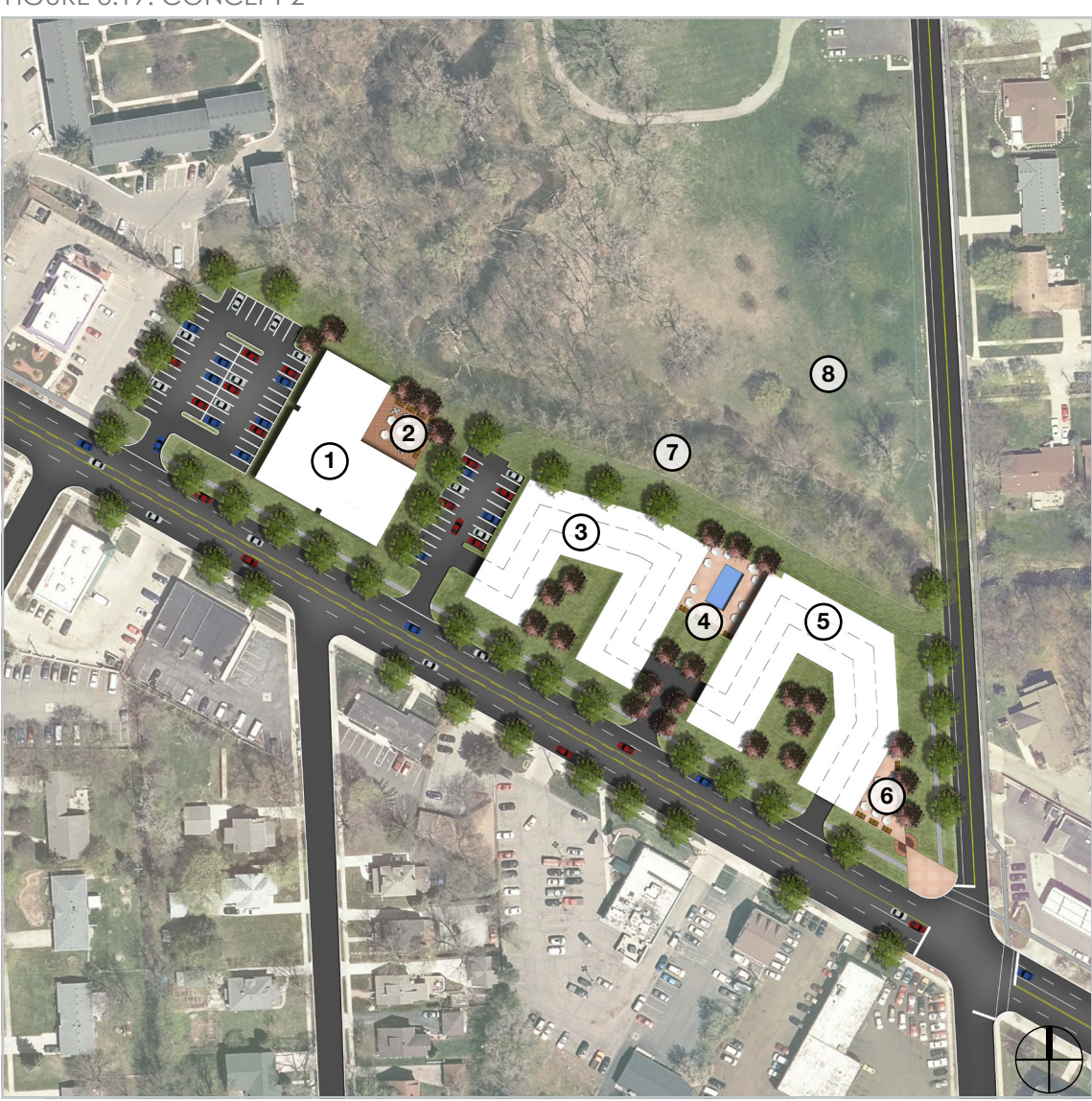
FIGURE 3.19: CONCEPT 2