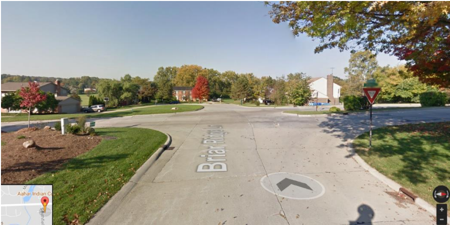
Briar Ridge Lane at Smithfield Road